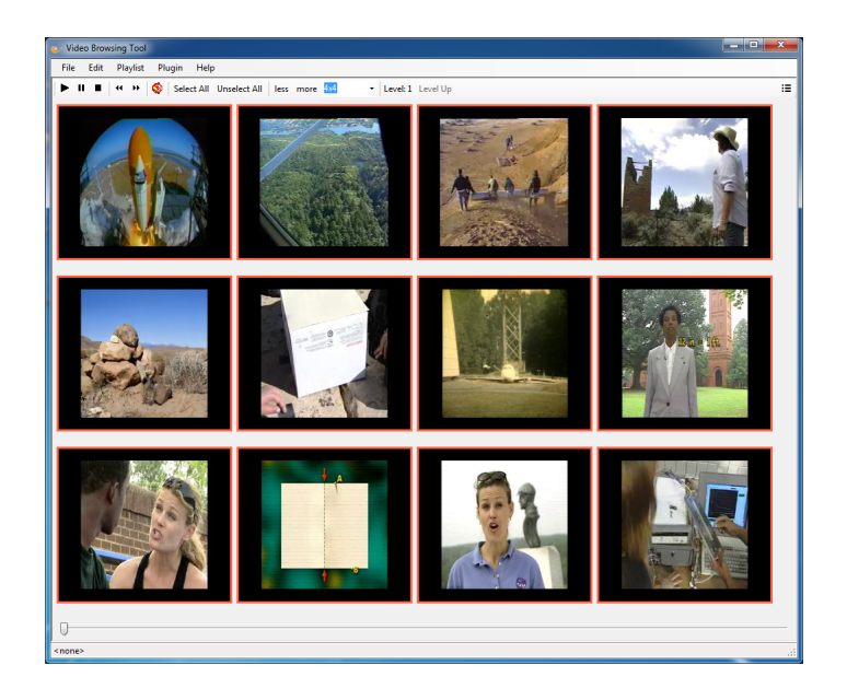
Fig. 1. Parallel View

again. To get a coarser view again, it is possible to go back to a higher level. The parallel view can only show one level of the browsing hierarchy at a glance.